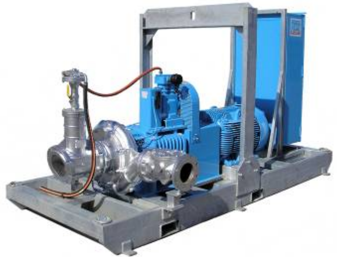
Stainless Steel Pump End shown