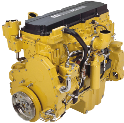
Image shown may not reflect actual engine